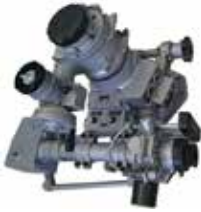
OP5-37 sight and mechanical sight