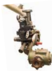
WR-40 mechanical sight