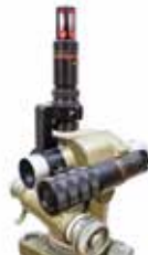
Artillery Aiming Circle PAB-2 (A)