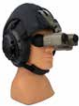
PNW-57M driver's night vision