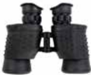
7×45 (z) prism binoculars