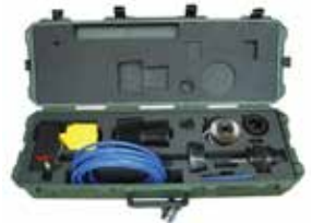
Semi-automatic barrel cleaning device