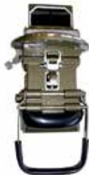
MK-4 observation device