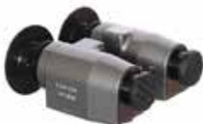
PNW-57M driver's night vision