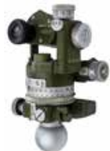
Artillery Aiming Circle PAB-6