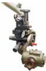
RM-70 mechanical sight