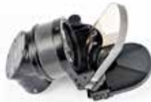
12,7 mm wkm DSzK collimator sight