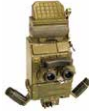
TKN-3B commander's day and night observation device